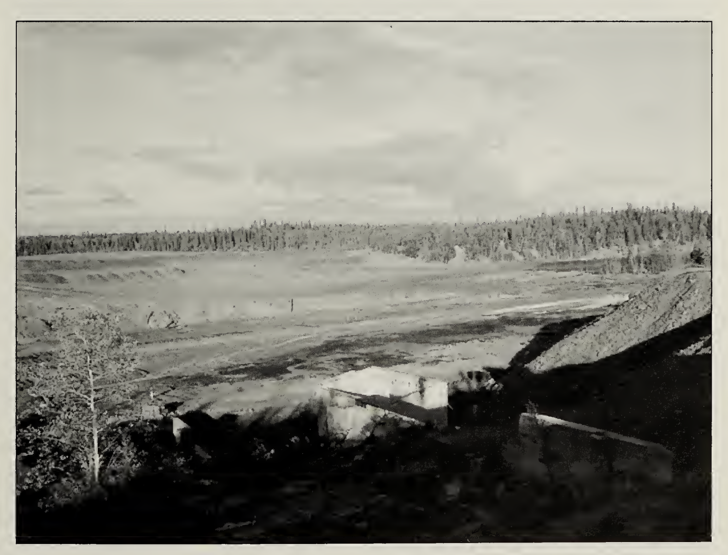
Figure 1. Sherritt-Gordon mine tailings pile, July 2005. The runoff from the pilecollects on the right before it enters Camp Lake.Jon Gerrard

its inception, the mine tailings pile has progressively acidified and has leached metals into adjacent Camp Lake and from Camp Lake to Kississing Lake. The latter is a large lake centred at 55°10'N and 101°20'W, within the boreal forest region of Manitoba and located east of Flin Flon. It has a surface water area of 275 km<sup>2</sup> and an irregular shoreline with many islands. The water from Kississing Lake flows north into the Churchill River.