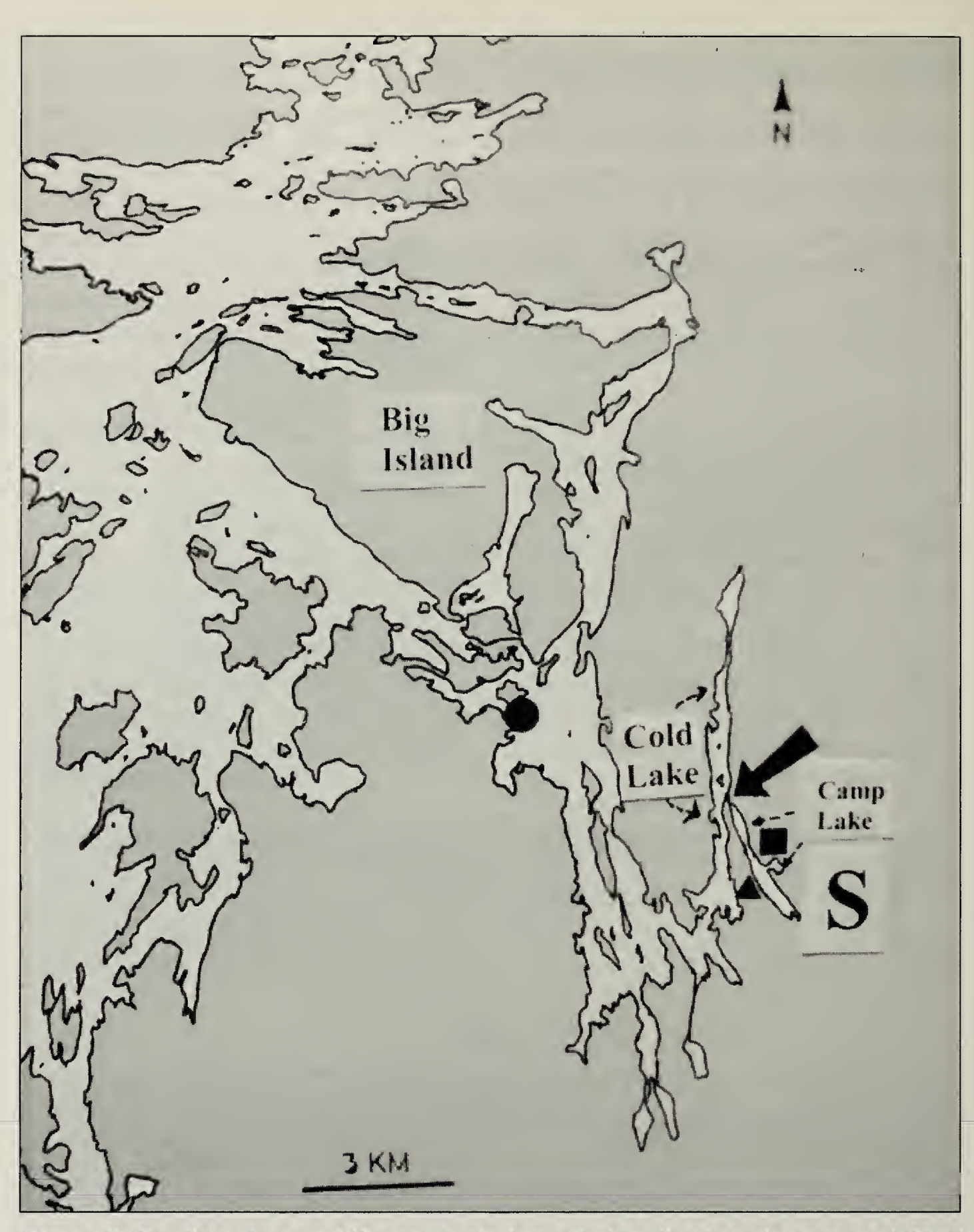
Figure 2. Southeast arm of Kississing Lake including the long bay named 'Cold Lake'. S = community of Sherridon; the arrow points to the site of the discharge from Camp Lake into Kississing Lake; \blacksquare = Serridon mine tailings pile; \blacktriangle = Kenanow Lodge and the small community of Cold Lake; \bigcirc = Kississing Lake Lodge

Little has been done to reduce the leaching of toxic metals from the tailings pile and they have leaked extensively into adjacent Kississing Lake. Indeed, as Moncour reports (p. v), "the annual loading of acid, sulfate, and metals